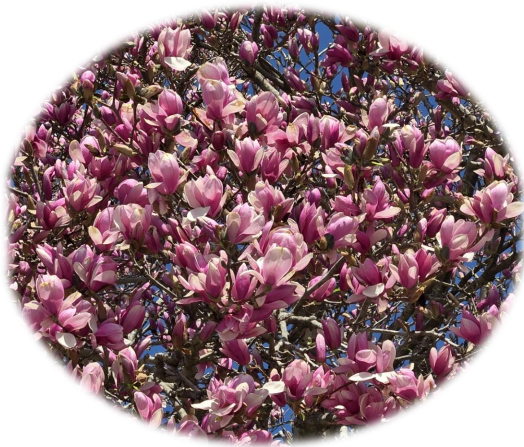
Church Magnolia Tree Blossoms

The Mission of Middle Octorara Presbyterian Church (U.S.A.) is to provide a place of fellowship where a community of believers comes together to be spiritually renewed and enabled to effectively witness for Christ through service to others.